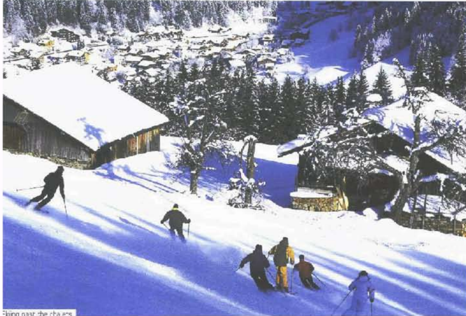
Skinn near the chalets